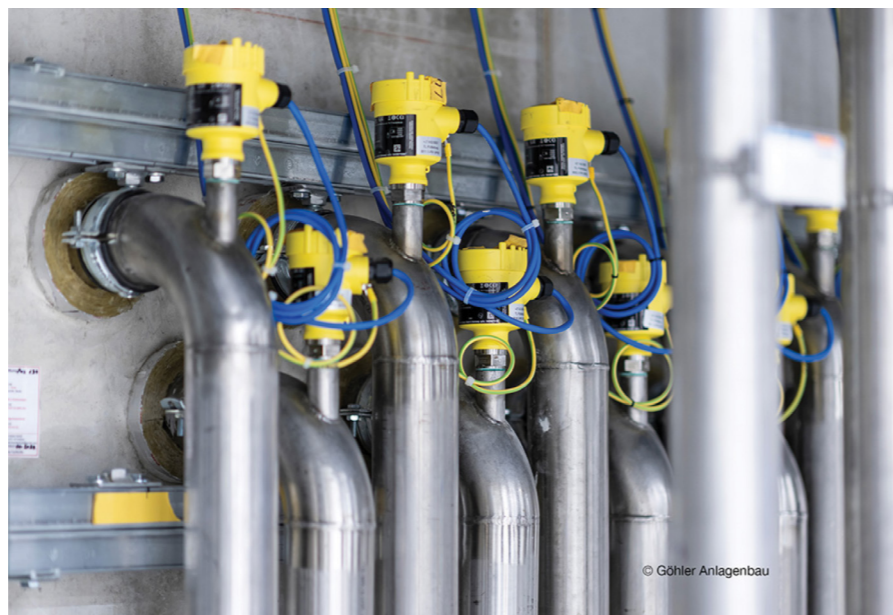
The new chemical tank farm at Scharr is equipped with around 170 VEGASWING 63 vibrating level switches, which protect the tanks from overfilling and leaks.

For precise level monitoring, overfill protection and early leak detection, the company relies on advanced measurement technology from VEGA. Among other instruments, around 170 VEGASWING series 63 and 40 vibrating level switches, as well as 40 VEGAPULS series radar level sensors, have been deployed. These not only enable con-