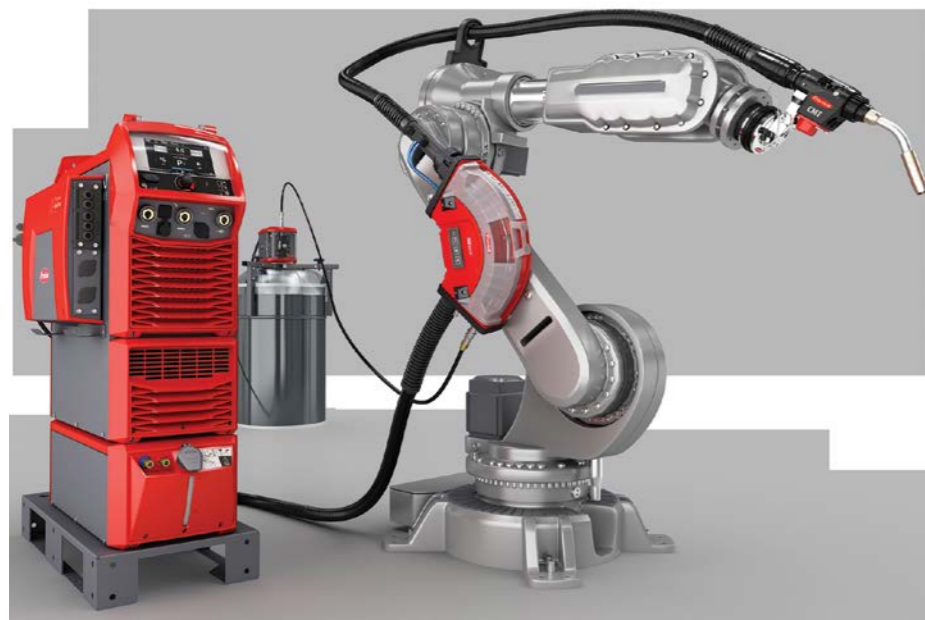
The Fronius CMT Additive Pro makes wire-based additive manufacturing a flexible alternative for conventional metal component production.