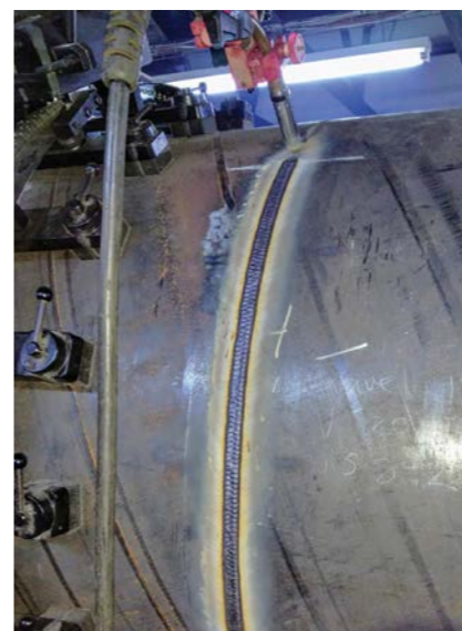
An application trial being done at Renttech’s Alrode premises. The root weld is being done using the Böhler Ecospark 420 (ER70S-6) solid wire and the Wiseroot function on a Kemppi welding machine. The fill and cap was then done using the Böhler Diamondspark 46RC (E71T-1M) flux-cored wire using a Promotech Rail Titan welding and cutting tractor.

“Customarily, for example, pulse machines were achieving slightly slower welding speeds than traditional CV welding, resulting in customers preferring the CV