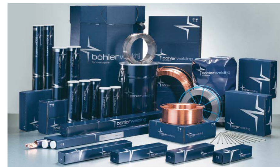
voestalpine Böhler Welding offers a complete consumable portfolio to service these different markets from ‘run of the mill’ mild steel consumables to specialised alloys and hard facing consumables across the various welding processes.

On the submerged arc side, Renttech is able to deliver a packaged solution using its UNIARC ASAW1250II – a 1 250 A machine with a 100% duty-cycle at 40 °C – with flux and wire combinations ranging from mild steel to the low- and high-alloys, hard facing as well as nickel alloys, all with the idea of chasing higher productivity, enhanced