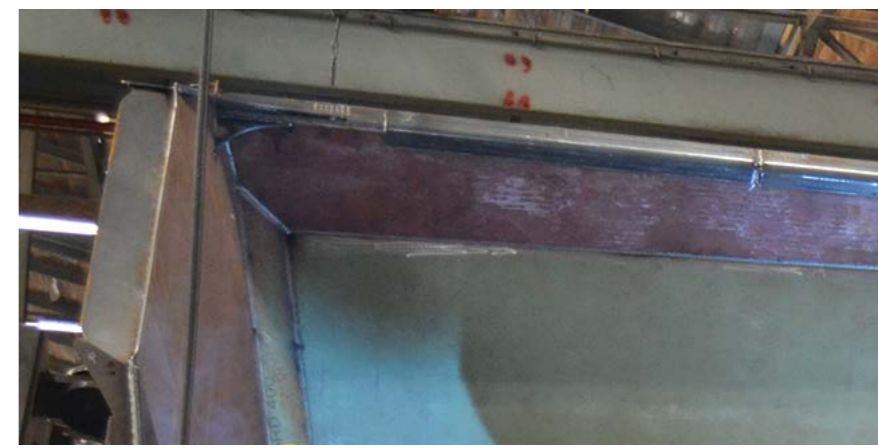
BHI can offer heavy fabrication expertise to all local equipment distributors, suppliers or users of any OEM's equipment.

Most notably for hydraulic cylinders, though, he says, Bell has implemented and perfected the friction welding technique to join the hydraulic pistons and rod ends to the chrome-plated push-rod material. "There are not too many fabricators with a friction welding capability. We have developed our own tooling design for this machine that includes all the clamps, jaws, hydraulics, and electronic controls," he says.