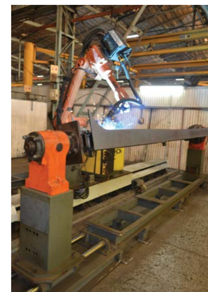
Robot welders and manipulators are typically used for long-section welding where surface finish is important.

Also, he continues, Bell/BHI does not have to keep large stocks of consumables. "We take deliveries of what we need every day, and the warehouse always keeps at least two months' worth of stock on hand.