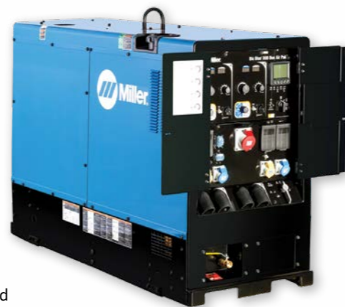
AWC is the exclusive distributor of the Miller brand of welding power sources, including the Miller Big Blue 800 Duo, a powerful diesel-driven welder that offers robust welding and auxiliary power output.

From a resource perspective, he says AWC combines all of Afrox's welding expertise, products and facilities into one entity. "We still have access to the same basket of products but it is now far easier