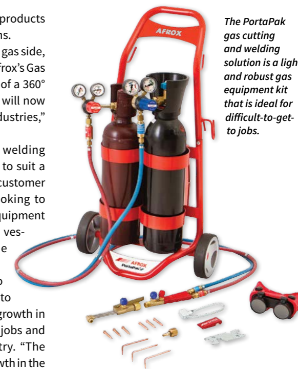
The PortaPak gas cutting and welding solution is a light and robust gas equipment kit that is ideal for difficult-to-get-to jobs.

"Our bigger, better and more flexible AWC will be able to deliver exceptional service to customers from and extended 'one-stop-shop' offering, with a highly experienced sales and welding applica-