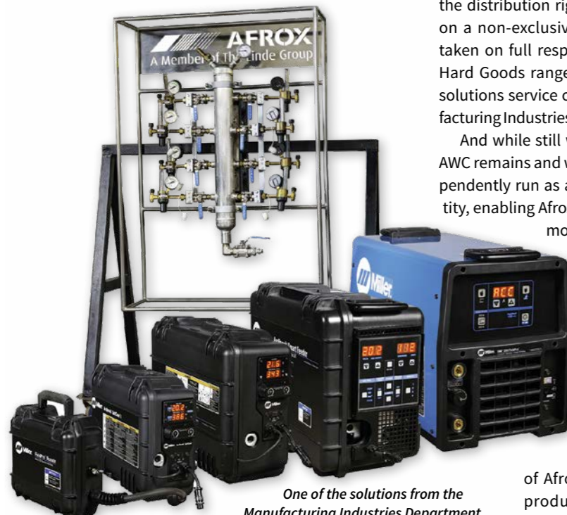
One of the solutions from the Manufacturing Industries Department, which now sits inside AWC, uses Miller ArcReach technology coupled the Afrox-developed Multi-User Pressure Panel (MUPP) for distributing gas to multiple welders working at height.