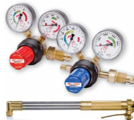
The Saffire® Legend 916 acetylene cutting torch with Saffire® 6000 regulators can cut steel up to 450 mm thick with an 8F cutting tip.

"We are also proud of our PortaPak gas cutting and welding solution, which is a light and robust gas equipment kit that is ideal for difficult-to-get-to jobs," he says. This whole range is supported by our internally developed 'Afrox Safety Solutions Programme', which assists our customers to conform to legal requirements as well as