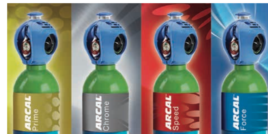
The four ARCAL shielding gases, ARCAL™ Prime, Chrome, Speed or Force – shown here in EXELTOP™ cylinders with an advanced and protected two-stage regulator with a flowmeter and on/off lever built in – cover over 80% of all welding applications.