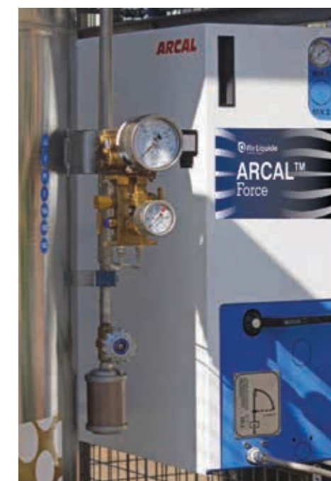
The ARCAL™ Microbulk solution comes with Air Liquide's pneumatically powered dynamic mixing panel, which has no moving parts and requires no power connection.

"We monitor the turnaround times of our gas cylinders, which allows us to recommend how many cylinders a client should hold and the ideal delivery frequency. Should we find the number of cylinders needed or the rotation rates to be high, we immediately know that a