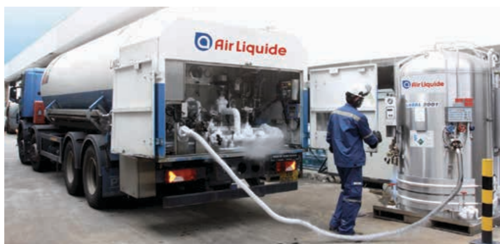
With a 4 m 2 footprint, Skid Tanks are an ideal solution for gas consumers who require 1 000 – 3 000 m 3 /month of gas.

For industrial operations that require a steady flow of oxygen, carbon dioxide, argon or nitrogen in excess of 2 000 Nm 3 per month, Air Liquide offers onsite bulk distribution and storage solutions. "We install