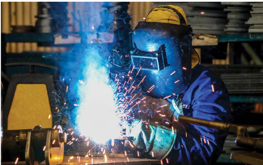
The Richards Bay Bell team of over 800 machinists, welders and assemblers is among the best in the country, thanks to the company's own training centre.