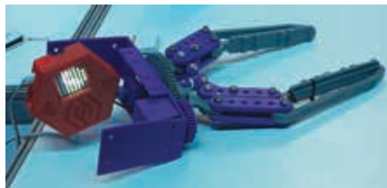
Left: productONE's Product Insight demonstration uses a 3D-printed bomb retrieval arm designed using topology optimisation.

operations. These benefits include reduced downtime, improved productivity, and increased flexibility. The bulb experiment used simple failure rate statistics collected over a short period of time to more accurately predict when a bulb was likely to need replacing.