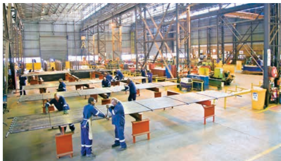
Babcock's fabricating facility celebrated 25 years of service to Africa's power generation and metallurgical industries in November last year.